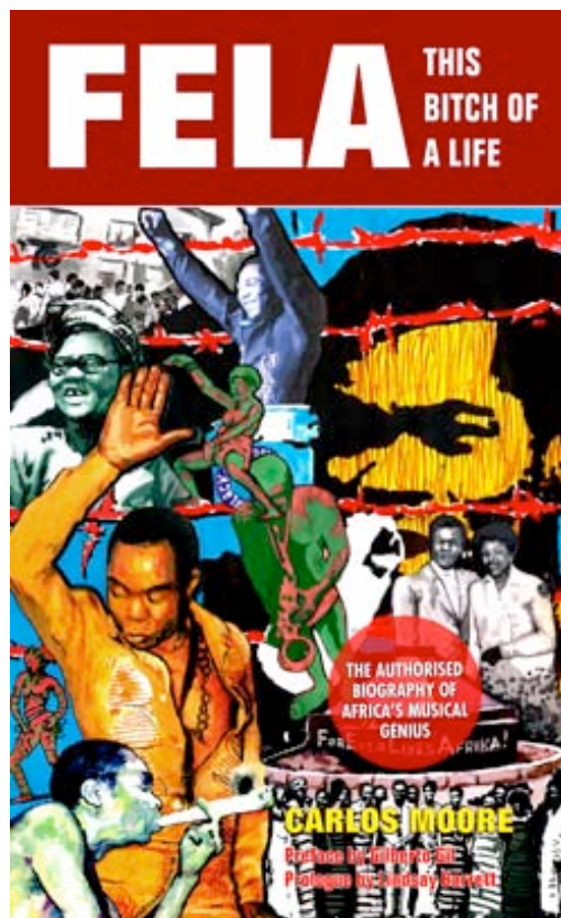
Front cover designed by Lemi Ghariokwu